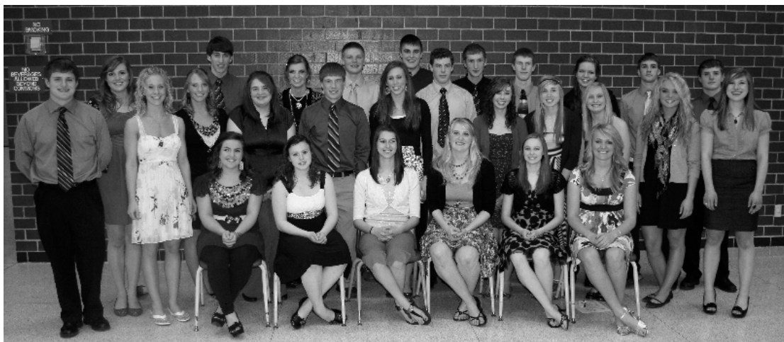
Above: AHS National Honor Society members.